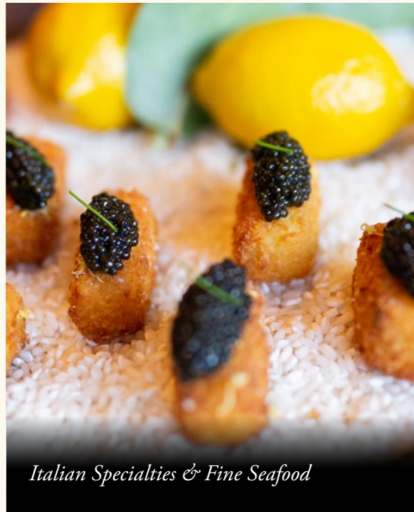
Italian Specialties & Fine Seafood