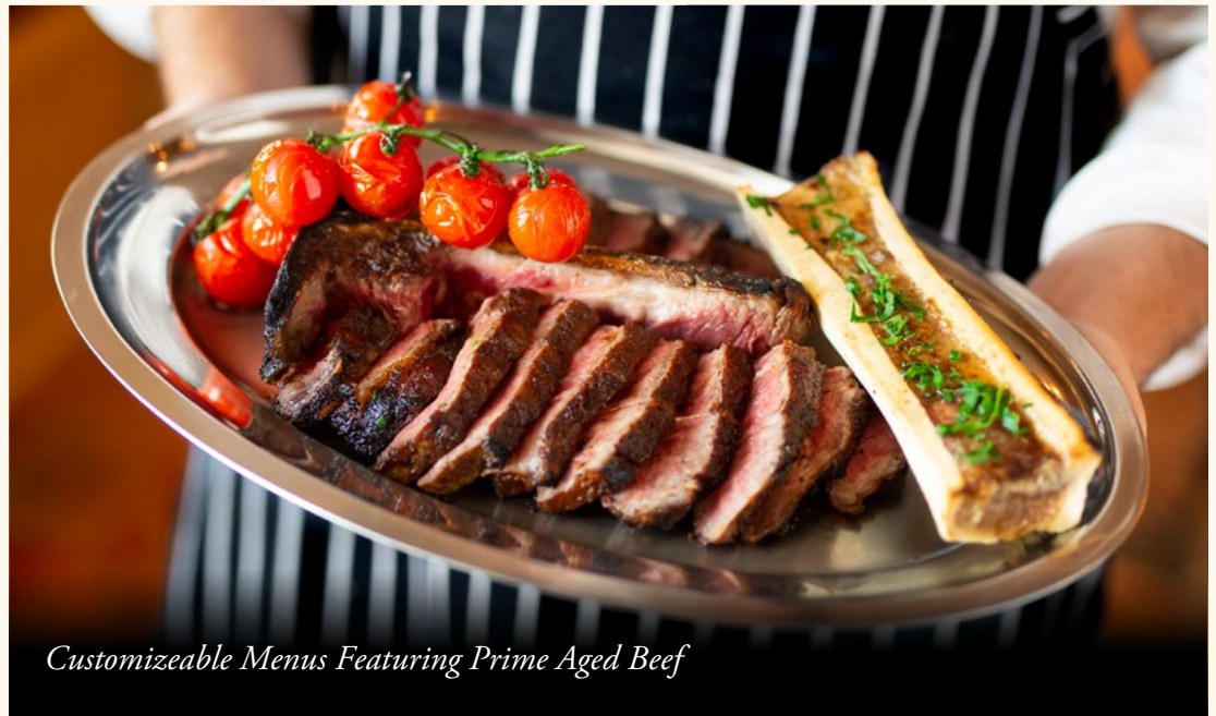
Customizable Menus Featuring Prime Aged Beef