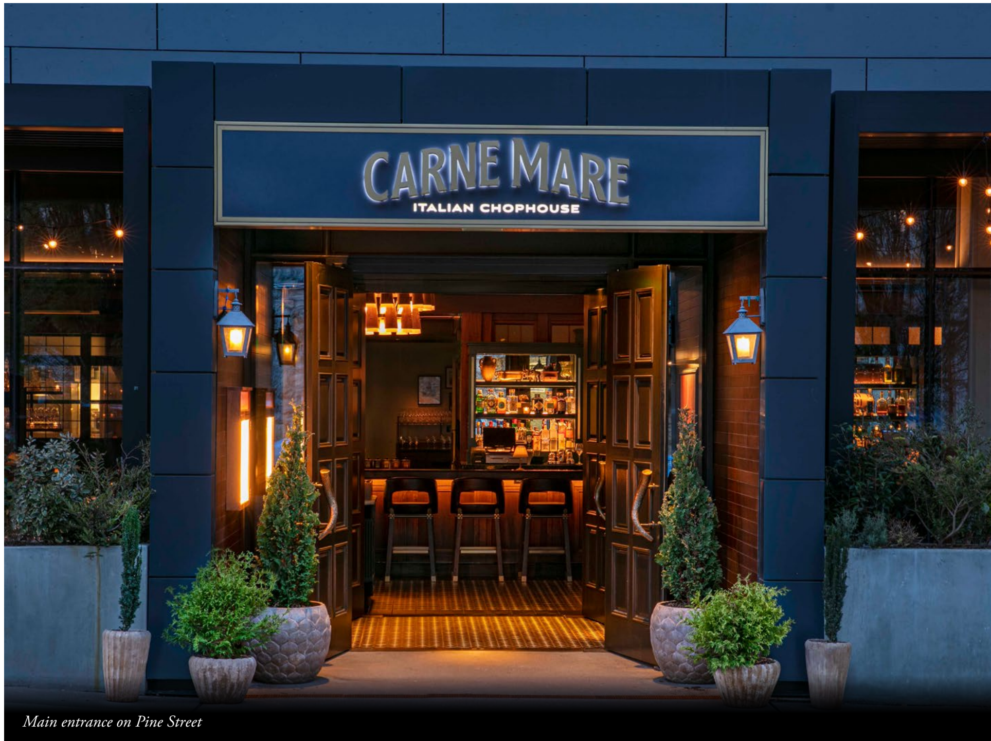
Main entrance on Pine Street