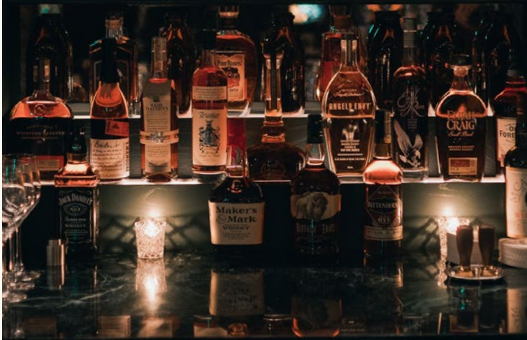
Top Shelf Spirits